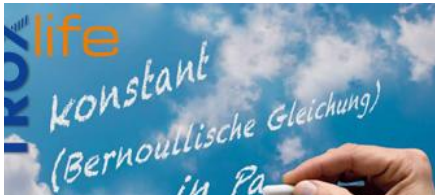
EDUCATION AIR. FOR HIGH MARKS IN THE CLASSROOM.