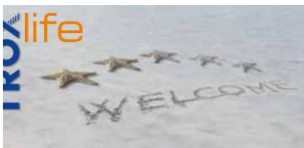
HOTEL AIR. THE WORLD A GUEST AT TROX.