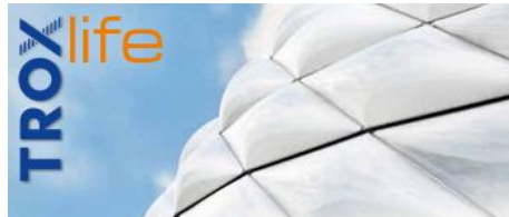
STADIUM AIR. STADIUMS AND THEIR PARTICULAR FLAIR