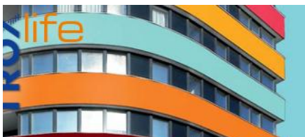
NO 13: ARCHITECTURE AND DESIGN. THE ART OF DESIGNING AIR.