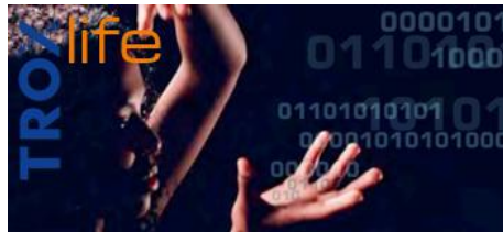
NO 16: ONES AND ZEROS. DIGITAL TRANSFORMATION.