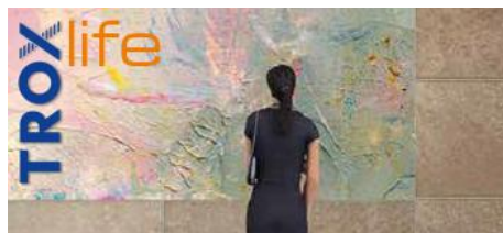
NO 12: ARTS AND CULTURE. ARTFUL AIR DESIGN