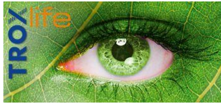
NO 19: SUSTAINABILITY. SUSTAINABILITY IS THE FUTURE.