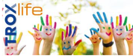
NO 22: SCHOOL + VENTILATION INTELLIGENT VENTILATION TECHNOLOGY NEEDS TO CATCH