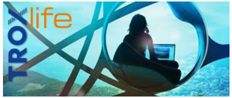
NO 18: COUNTRY AIR, CITY AIR. URBANISATION AND THE CONSEQUENCES.